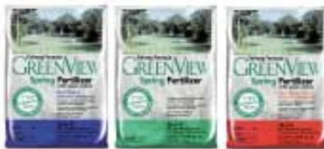
Fertilizer and Crabgrass Preventer